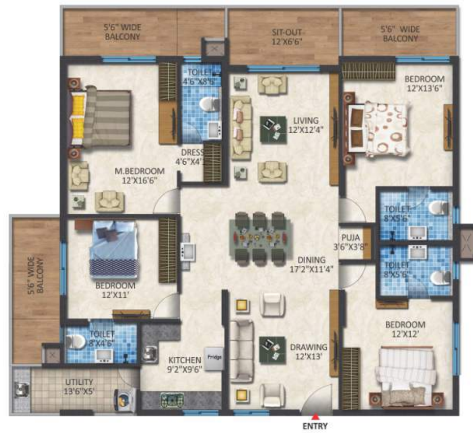
Flat No. 1 - East - 4BHK 2580sft