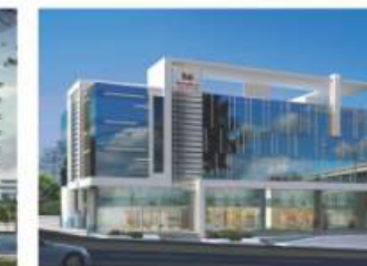
NIHARIKA JUBILEE ONE