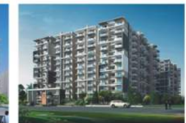
NIHARIKA EXOTICA ICONIC LIFESTYLE APARTMENTS