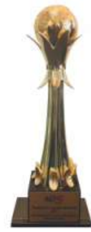
TV5 TV5 Best Residential Projects Award Niharika Exotica