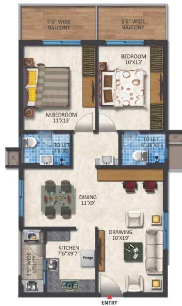
Flat No. 2 - East - 2BHK 1295sft