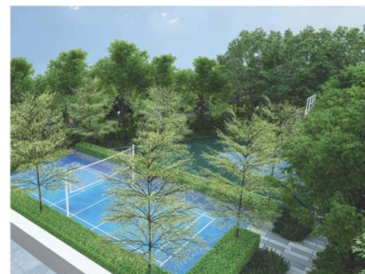
Right : an artistic rendering of Niharika Skyline Swimming Pool View Bottom : an artistic rendering of Niharika Skyline Outdoor Games View