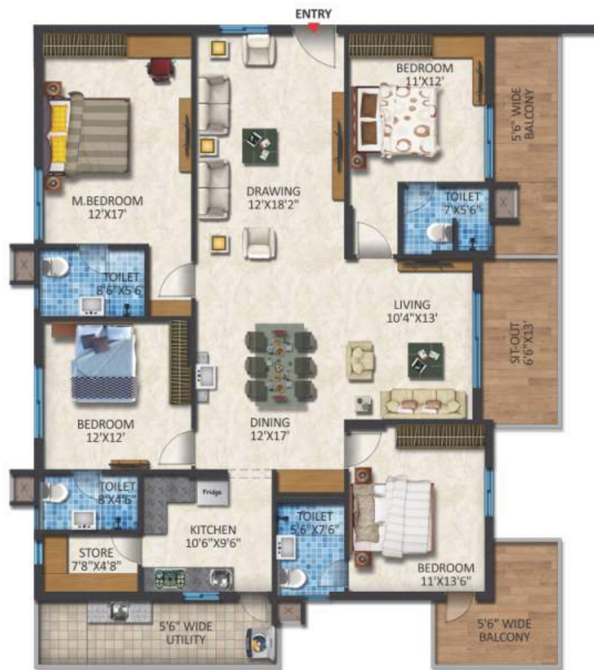
Flat No. 10 - West - 4BHK 2650sft