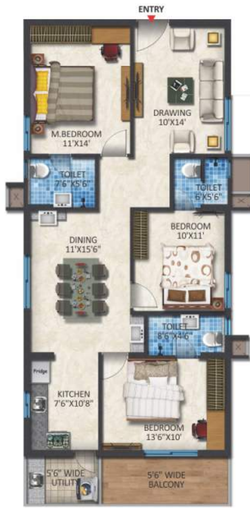
Flat No. 9 - West - 3BHK 1560sft