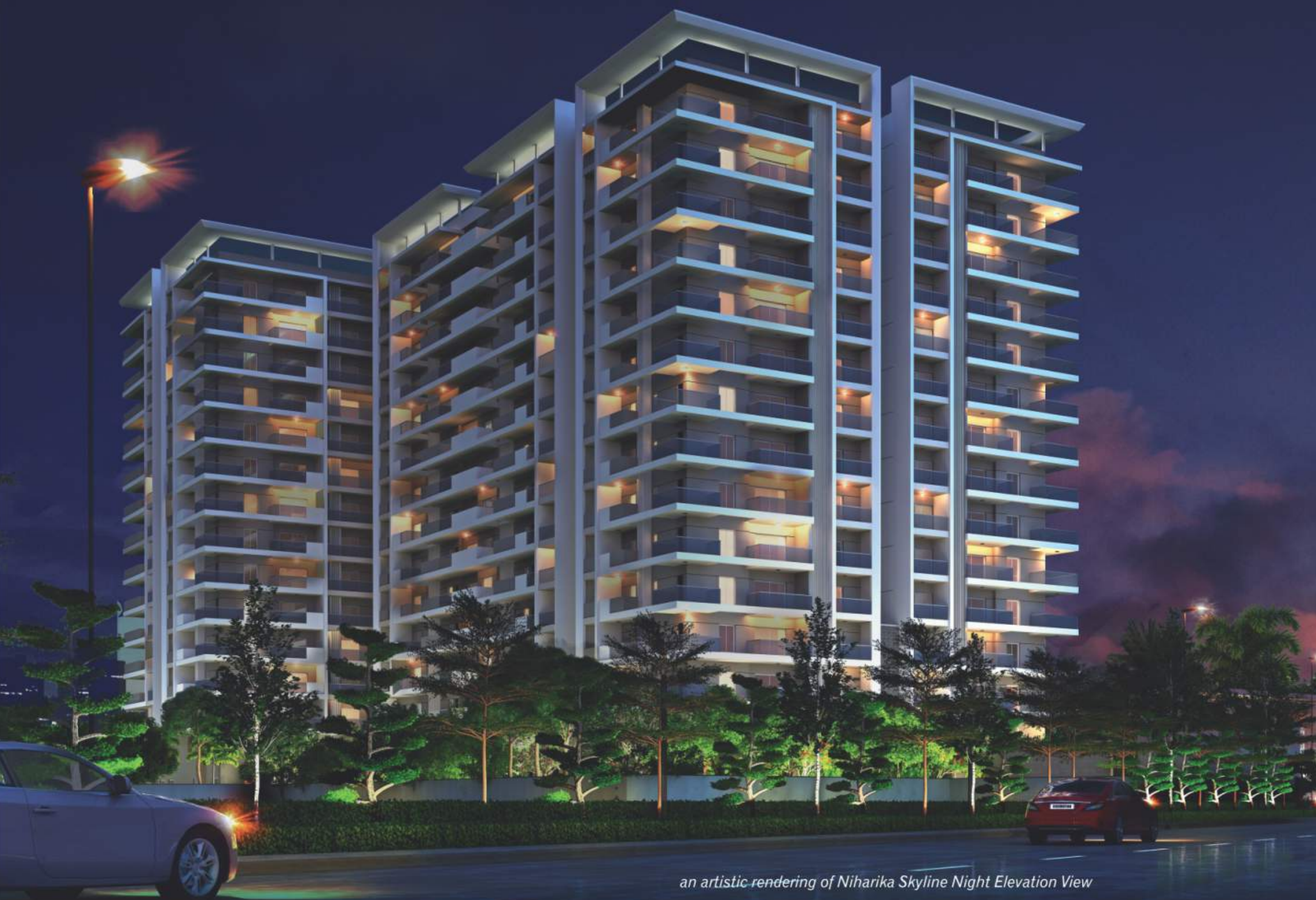
an artistic rendering of Niharika Skyline Night Elevation View